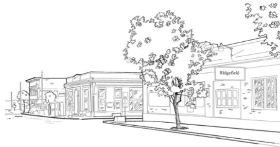
CITY OF RIDGEFIELD, WASHINGTON. est. 1909

Connecting our historic past with a healthy future where people, nature and business flourish together